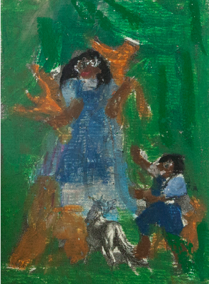
The Fables of Sanbras, 2023.

The mangrove is a type of tree or shrub that you can find on Guadeloupe and other tropical coasts. Mangrove forests grow in shallow seas, and the trees have big roots that grow partly above the water. The mangrove forest is very important for the people and the animals on the island of Guadeloupe. One reason is that the animals can find shelter between the roots and between the leaves. Together with the other children and the animals, Sanbras is looking for solutions that will fix some of their problems. She feels that the mangrove could become their safe haven.