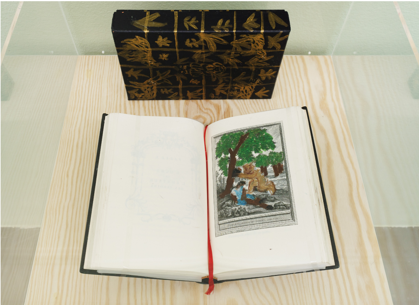
The Fables of Sanbras, 2023.