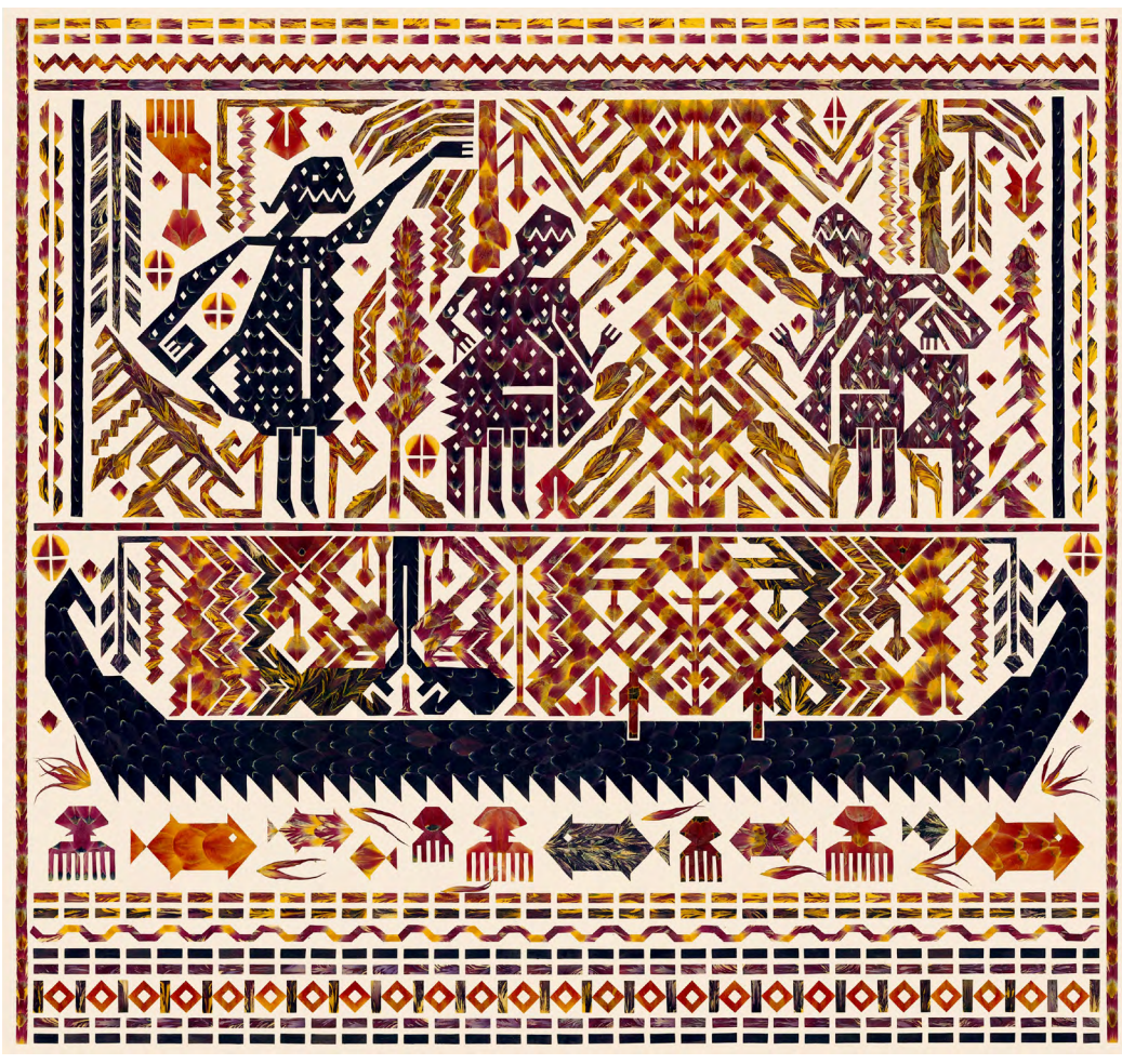
Tampan World Mountain Tree of Life 2021 Collection Centraal Museum Utrecht

The tulip is the national symbol of the Netherlands, the country where the artist lives. The Netherlands claimed Indonesia as a colony between the 17th and 20th centuries.