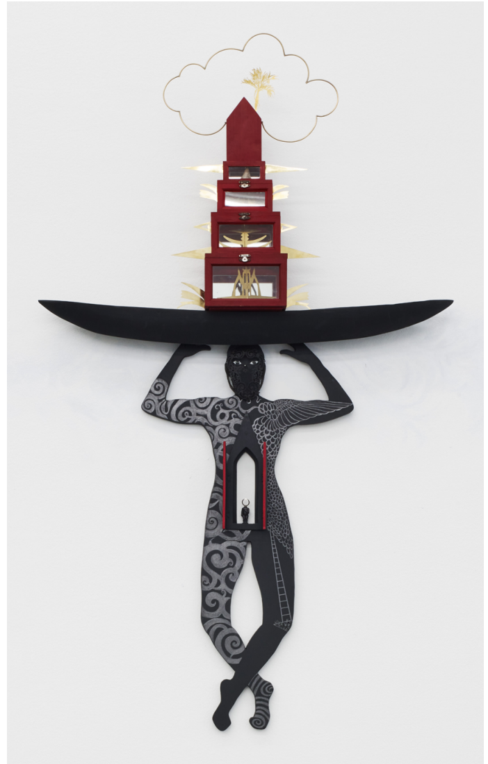
Zangukunu-An instrument for levitation, 2021.

Tip! Need some inspiration? Click here and see what other participants have already made.