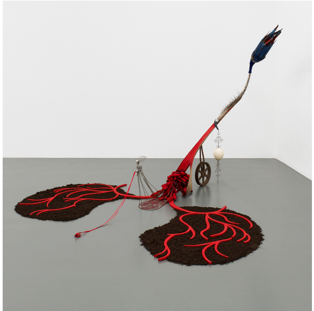
Terra Preta, 2016.

Together they form art pieces that tell us something about the history of the Caribbean. The history of the Caribbean is sometimes difficult, but the artist also likes to show the beauty of this history and invites us to think about it. The work shows how incredibly strong people are.