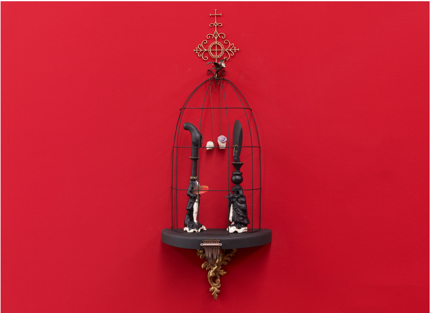
I know why a caged bird sings - Can we find a different Melody?, 2017.